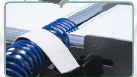
Front Support Table allows thicker books to be opened in half for easier insertion.