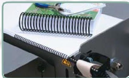
Full Range – From the smallest notepad to the largest calendar. Diameters 6-50 mm.