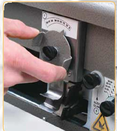
Simple dial adjustments to change from a 6 mm to a 50 mm coil.