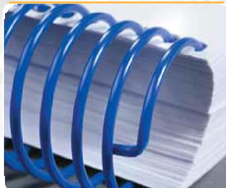
Longer crimp achieved as coil diameter increases.